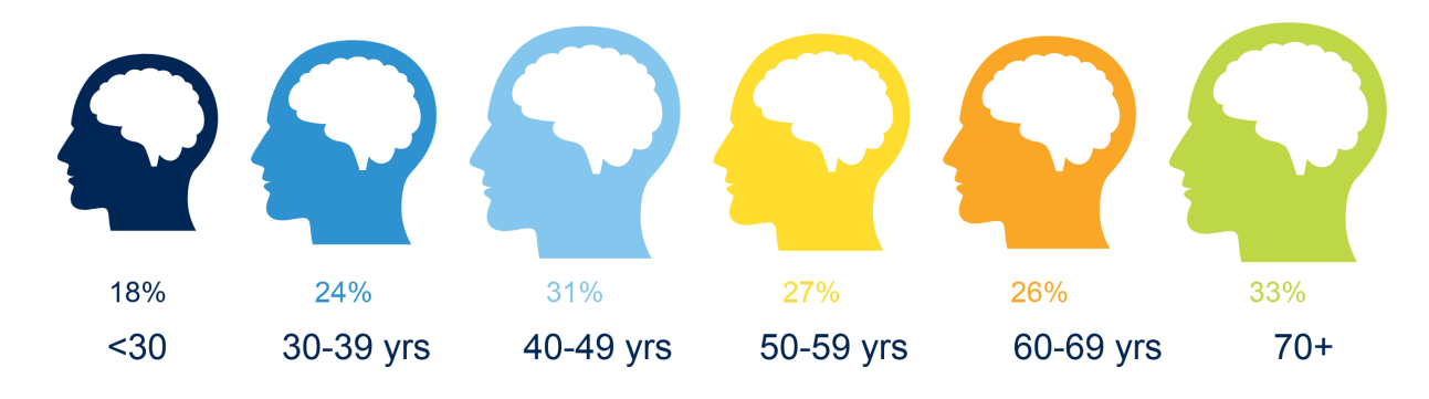
Based on a 2018 Perpetual survey of 3000 Australians.